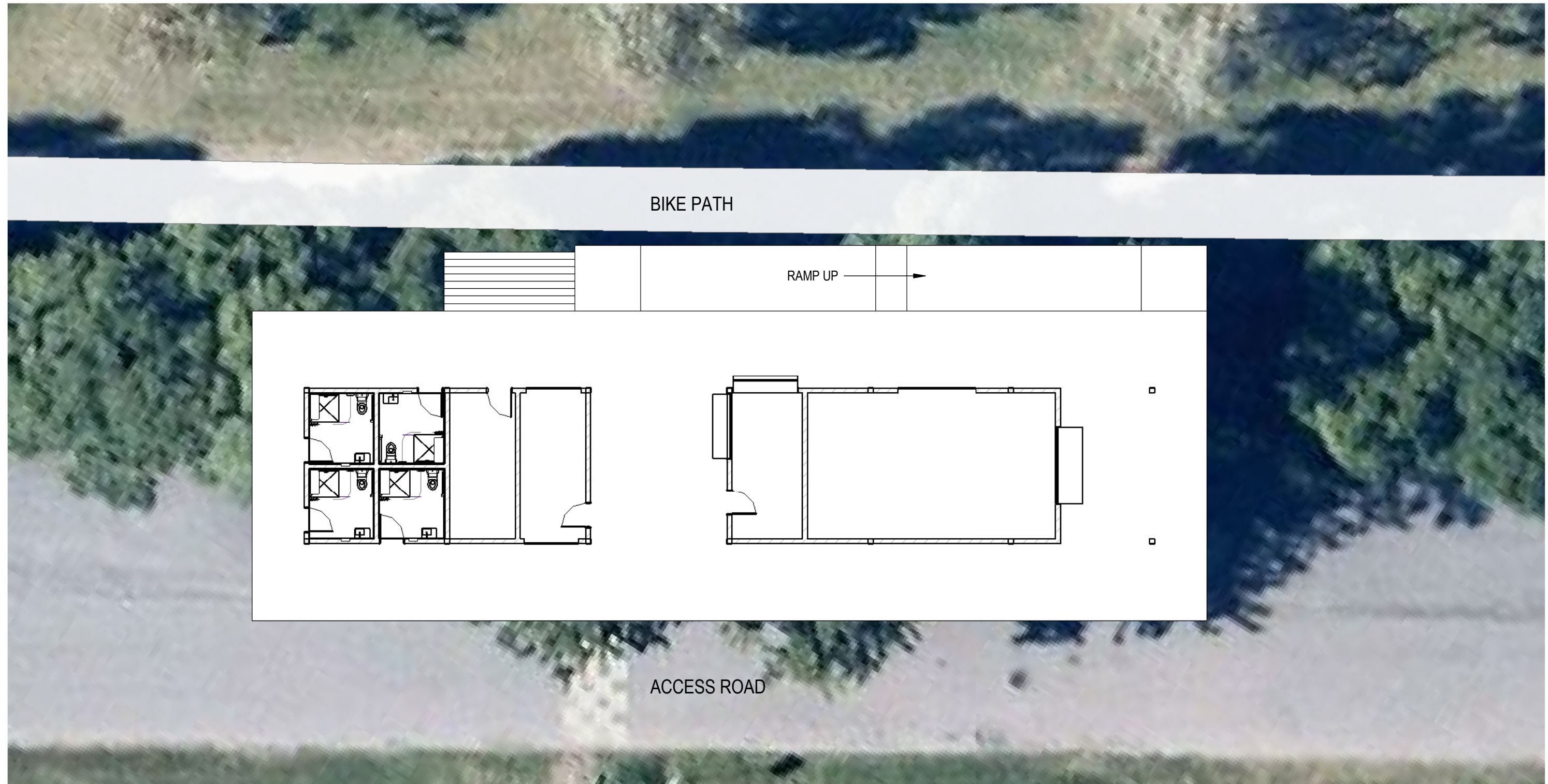
RAMP OPTION 02 SCALE 1 : 150