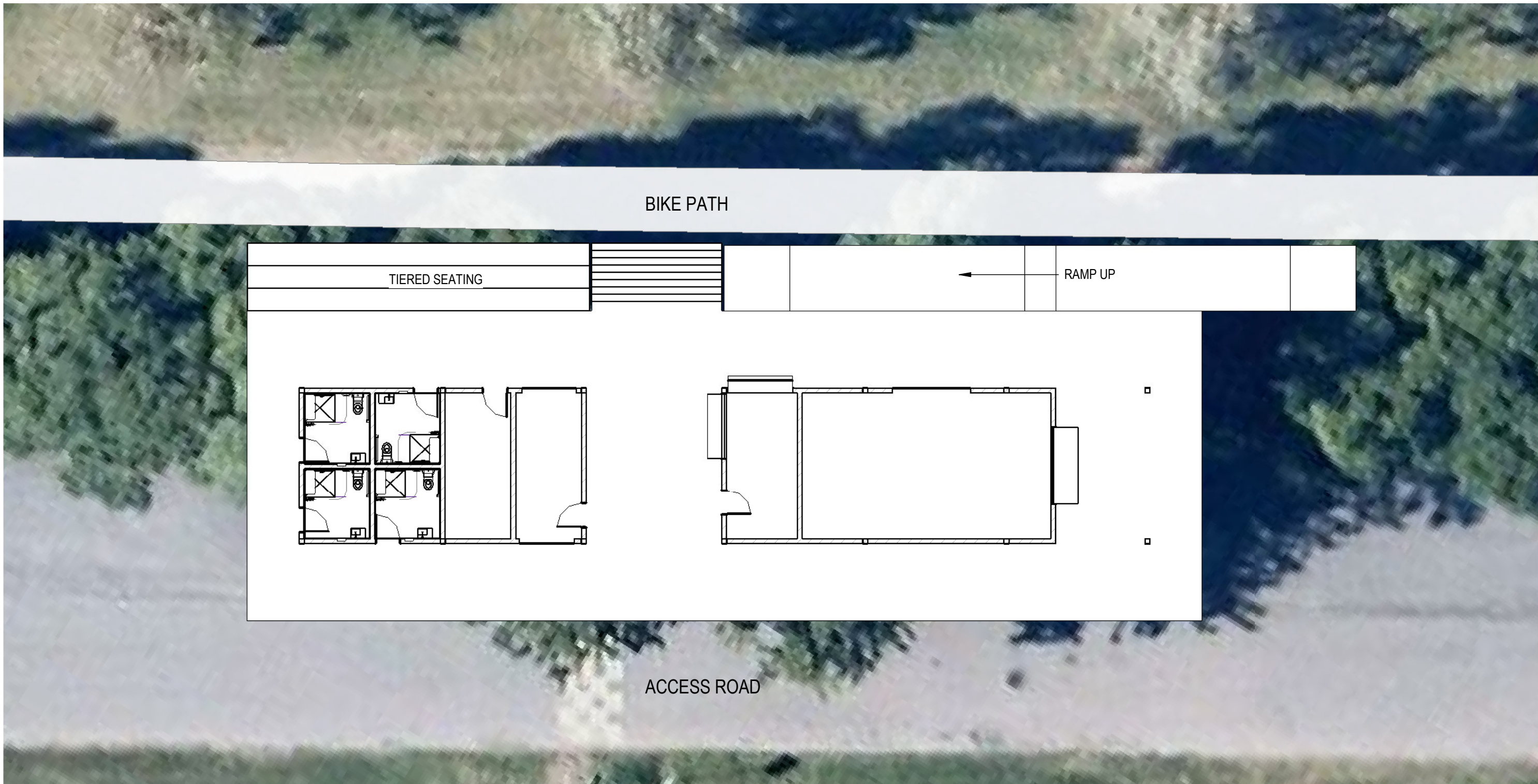
RAMP OPTION 01 SCALE 1 : 150