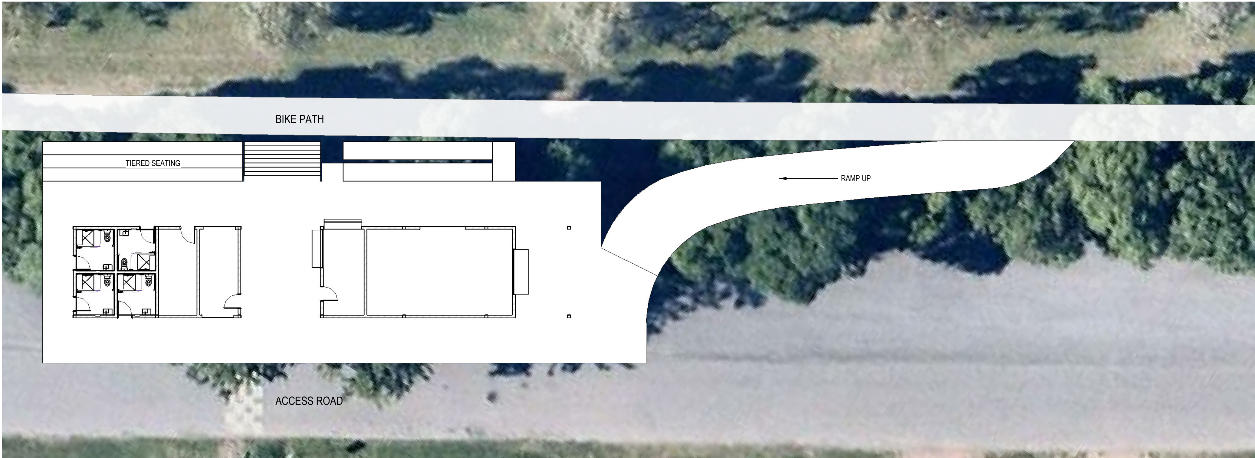
RAMP OPTION 03 SCALE 1 : 150