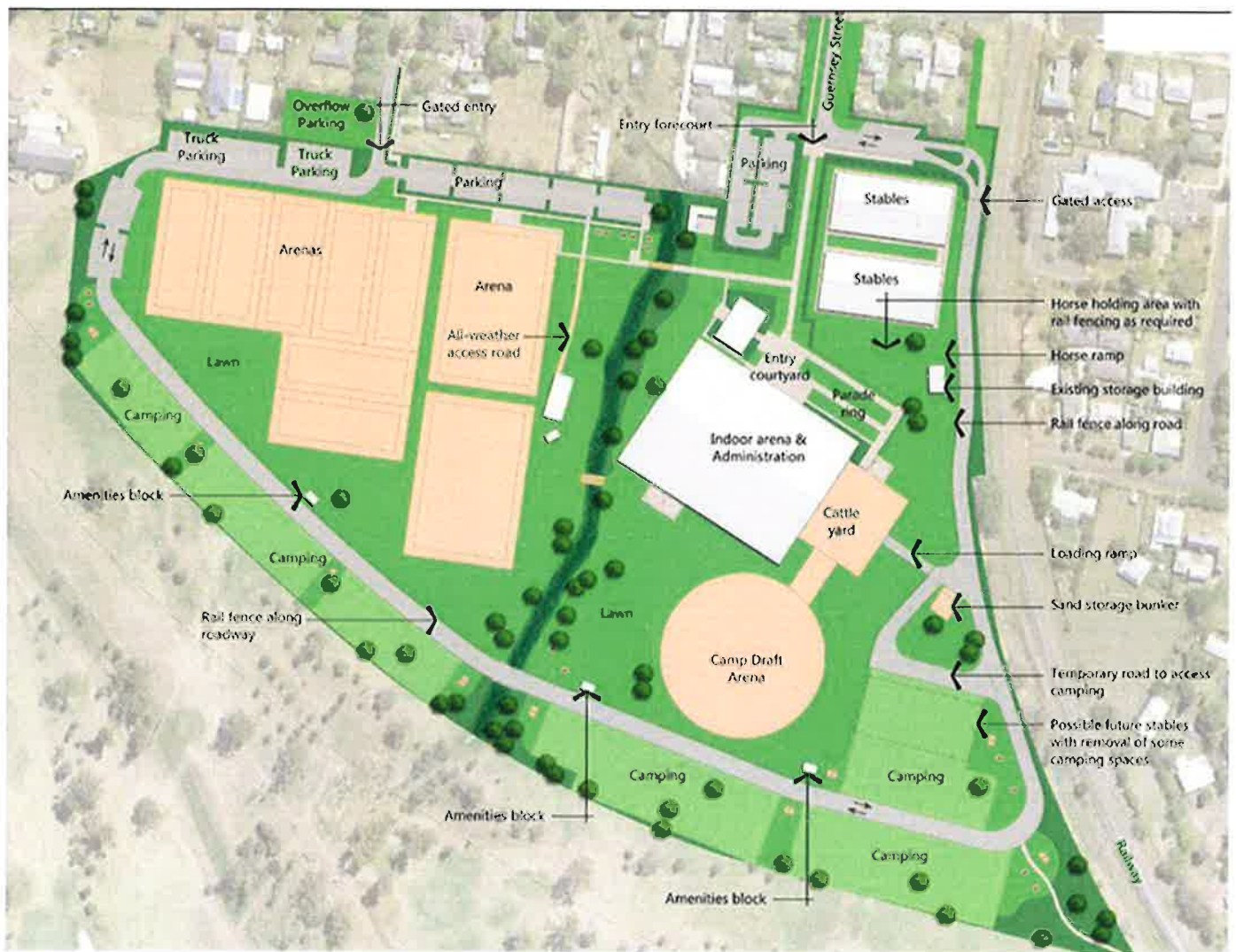
Figure 4 Conceptual Design Scone White Park