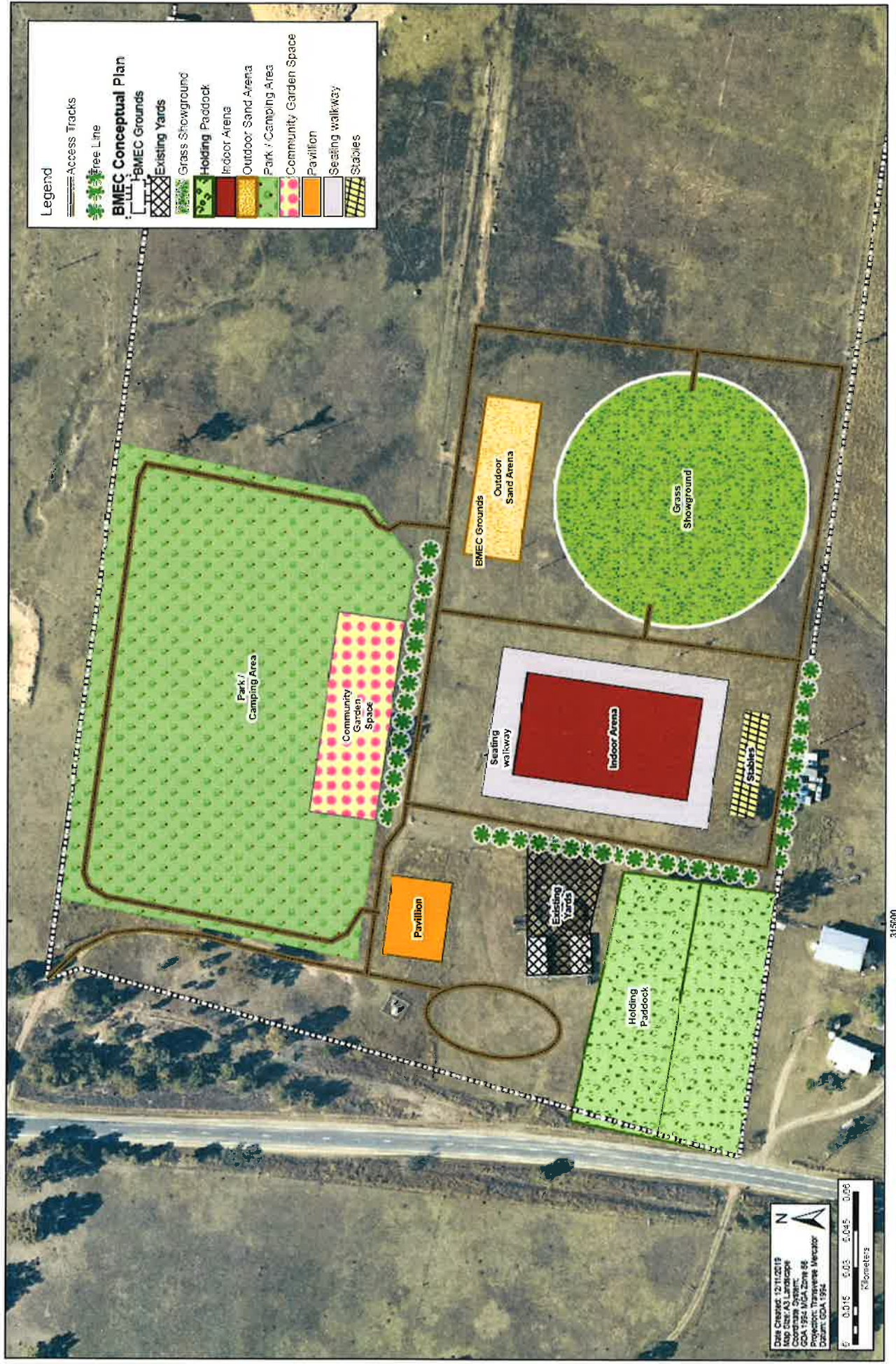
Figure 1 Conceptual Site Design