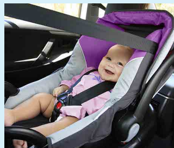
Up to 6 months Approved rear facing child car seat.

If your child is too large for the child restraint specified for their age, they may move to the next level of child restraint.