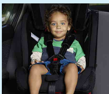
6 months to 4 years Approved rear or forward facing child car seat.