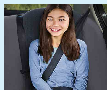
145cm or taller Suggested minimum height to use adult lap-sash seatbelt.